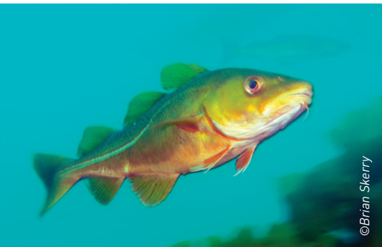
Atlantic cod depend on protected areas like Cashes Ledge.

“Allowing new bottom trawling on any part of Cashes Ledge would damage critical spawning and nursery areas.”