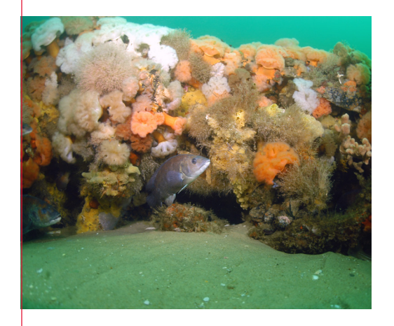
A colorful array of marine life covers the remains of a shipwreck in Stellwagen Bank National Marine Sanctuary.

The biological richness and productivity of New England's ocean is illustrated in the diversity of ocean and coastal habitats found in the Gulf of Maine, Georges Bank, southern New England and the Outer Continental Shelf. For over a decade, the Conservation Law Foundation has studied the vital component that ocean habitat provides for ocean wildlife and New England's commercial and recreational fishermen. Several ecological areas in New England's ocean are consistently noted as the most important for ocean wildlife and serve as reservoirs of productive fish populations and as refuge for rare, threatened or endangered species. New England's special ocean areas include