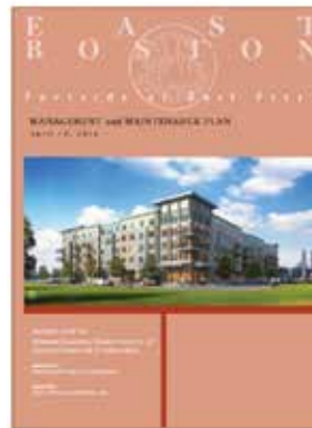
A management plan for a site in East Boston.

Signage should encourage people to use the amenities offered at a site. The number of signs, where they are placed, and what they say are all specified in the site management plan. If holders of waterways licenses do not provide adequate signage to inform people of available public spaces (for example, the location and hours of public restrooms), they may be violating their management plan or license. Unfortunately, many sites across Massachusetts fall short of the signage requirements (note that, in Boston, signs identifying the Harborwalk are distinct from what is required by the Waterways Regulations). In addition, MassDEP's minimum signage requirements are listed on MassDEP's website [SEE RESOURCES ON PAGE 27 FOR URL].