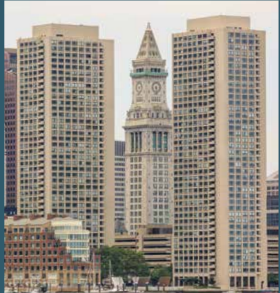
The Harbor Towers do not conform to the Waterways Regulations because they were built before the current law went into effect.

Some buildings may not comply with Public Waterfront Act regulations because a municipal harbor plan (MHP) has modified those requirements for this specific area. The municipal harbor planning program provides cities and towns with some flexibility in how they develop waterfront areas, as long as they do not compromise the site's overall public benefits. For instance, they allow cities and towns to propose modest alternative requirements for things like building height. Fan Pier in Boston's Seaport District is an example of a site built under an MHP (SEE PAGE 22 FOR MORE ON THESE PLANS).