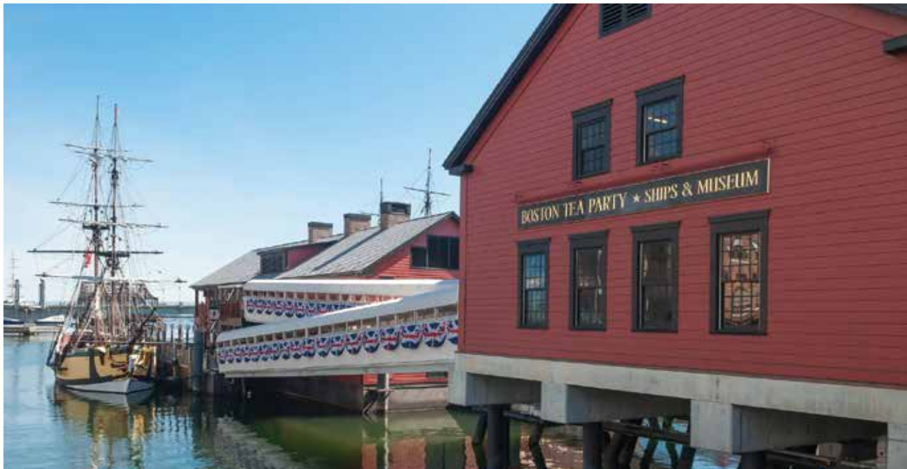
The Boston Tea Party Museum sits on existing pilings.